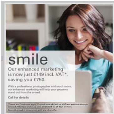
PDF version 1.4

Below are examples of artwork supplied higher than the PDF version 1.3 with the converted file fix along side.