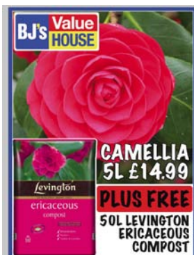
Converted to CMYK