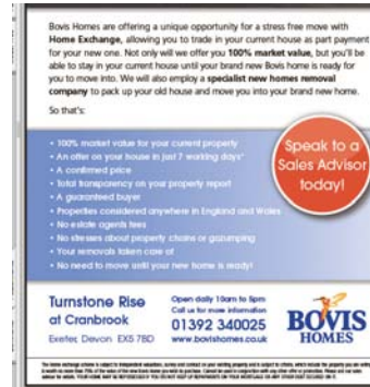
PDF version 1.6