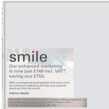
Flatten fix attempt