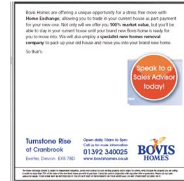
Flatten fix attempt