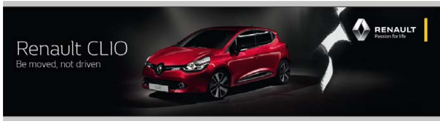
PDF version 1.6