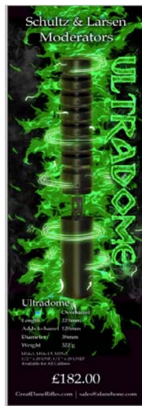
Supplied using RGB