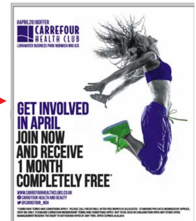
Converted to CMYK