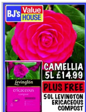
Supplied using RGB

Below are examples of artwork supplied in the wrong colour space (as RBG) with the converted file fix along side. RGB colours cannot be re-created in the CMYK colour space; if an RGB file is received the colours from the original file may have to be altered.